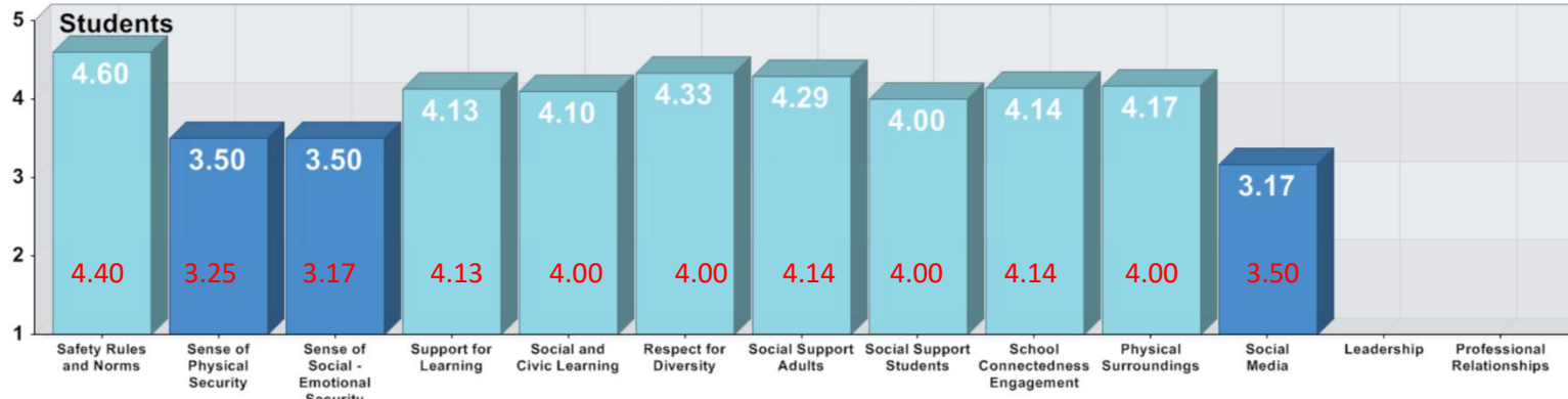
School Climate Ratings - Positives, Negatives and Neutrals

(Students = 112, Parents = 30, Personnel = 38)