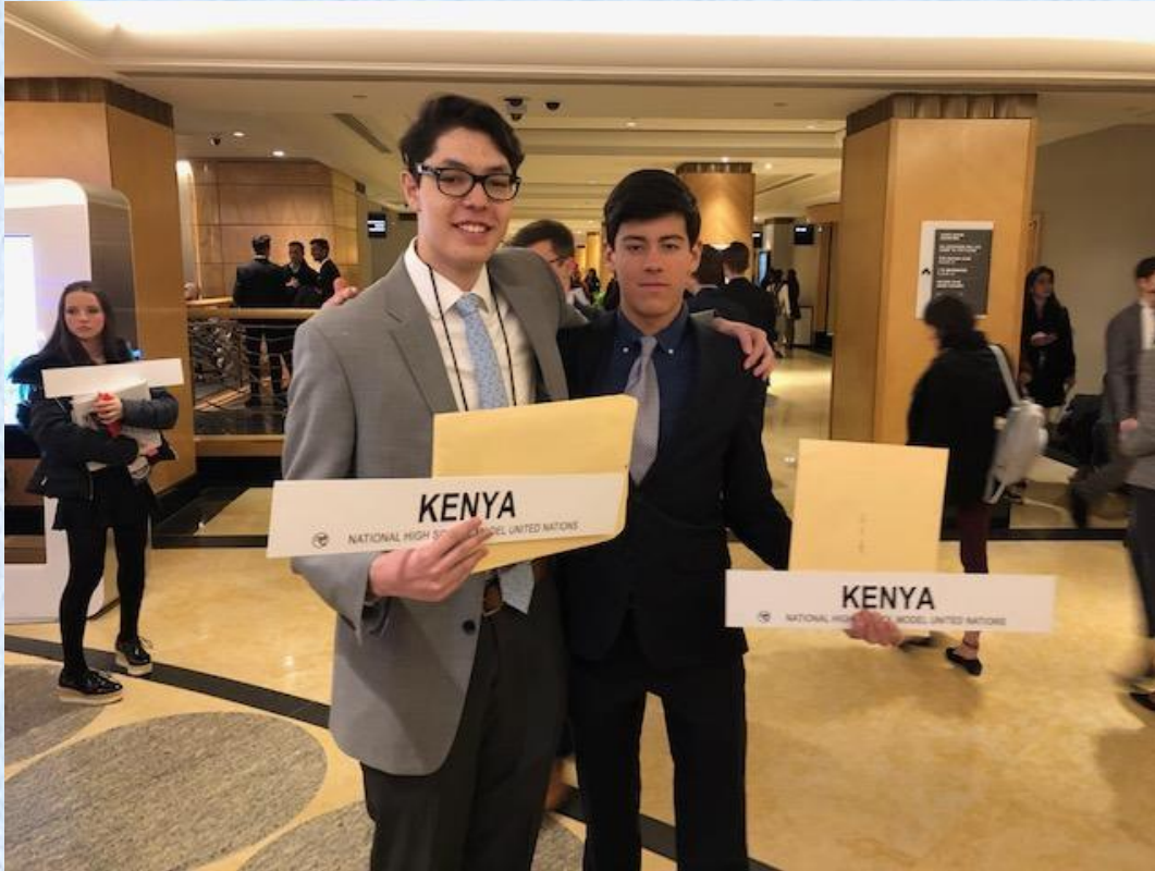
Model UN Competition, United Nations, NYC, April 2019