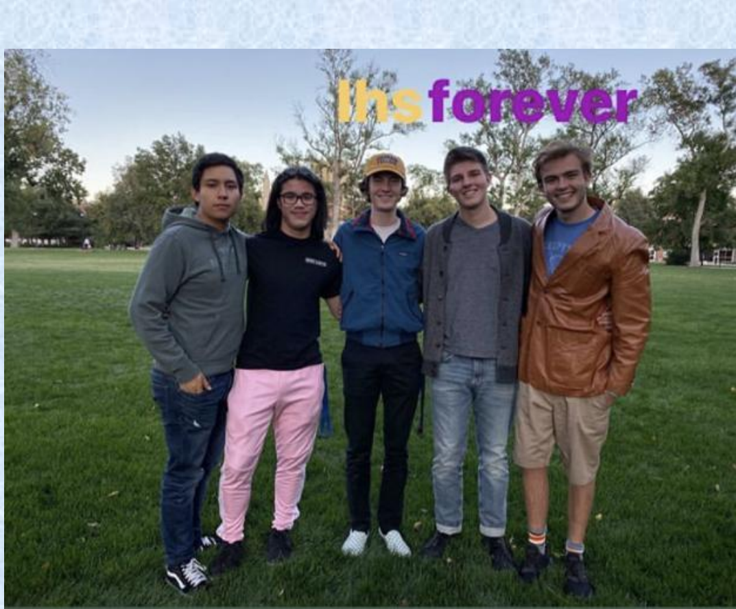
2019 IB graduates at Colorado College