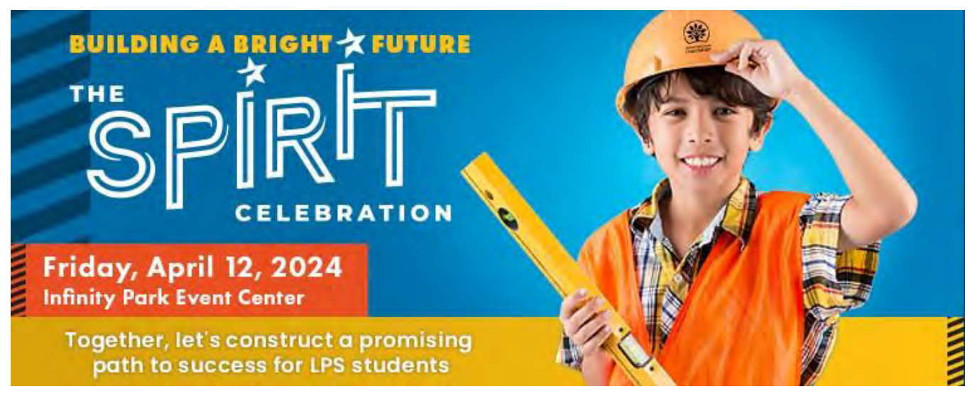
You're Invited to the 2024 Spirit Celebration

Join the Littleton Public Schools Foundation for The Spirit Celebration on Friday, April 12, at Infinity Park Event Center. This annual fundraiser brings our community together to Build a Bright Future for Littleton Public Schools. As a guest, you'll enjoy a festive cocktail hour, a fantastic dinner, sensational student performances, and an inspiring program. In addition, you'll have the opportunity to bid on unique silent and live auction items.