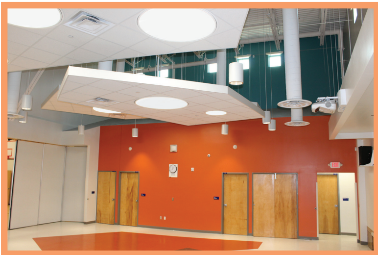
Runyon has an incredible new look and raised roof throughout. Fully-renovated, Runyon will reopen its doors to students in August.