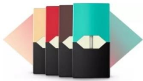
JUUL pods.

The term “electronic cigarettes” covers a wide variety of products now on the market, from those that look like cigarettes or pens to somewhat larger products like “personal vaporizers” and “tank systems.” Instead of burning tobacco, e-cigarettes most often use a battery-powered coil to turn a liquid solution into an aerosol that is inhaled by the user. One e-cigarette device, called a JUUL, has become increasingly popular in recent years.