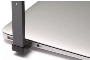
JUUL device charging in the USB port of a laptop.

JUUL Labs produces the JUUL device and JUULpods, which are inserted into the JUUL device. In appearance, the JUUL device looks quite similar to a USB flash drive, and can in fact be charged in the USB port of a computer. According to JUUL Labs, all JUULpods contain flavorings and 0.7mL e-liquid with 5% nicotine by weight, which they claim to be the equivalent amount of nicotine as a pack of cigarettes, or 200 puffs. JUULpods come in five flavors: Cool Mint, Crème Brulee, Fruit Medley, Virginia Tobacco, Mango, as well as three additional limited edition flavors: Cool Cucumber, Classic Tobacco, and Classic Menthol. 1 Other companies manufacture “JUUL-compatible” pods in additional flavors; for example, the website Eonsmoke sells JUUL-compatible pods in Blueberry, Silky Strawberry, Mango, Cool Mint, Watermelon, Tobacco, and Caffé Latte flavors. 2 There are also companies that produce JUUL “wraps” or “skins,” decals that wrap around the JUUL device and allow JUUL users to customize their device with unique colors and patterns (and may be an appealing way for younger users to disguise their device).