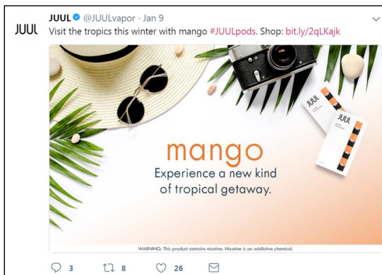
JUUL Twitter Post. January 9, 2018.

However, social media continues to help fuel JUUL’s popularity. While JUUL’s Instagram account is age-restricted to those 18 and older, its Twitter account is not age restricted and contains similar content. Additionally, JUUL-sponsored posts and user-generated posts that tag (e.g., #juulvapor, #doit4juul) and feature JUUL have no restrictions. These kind of social media posts can increase exposure to pro-e-cigarette imagery and messaging, by making JUUL use look cool and rebellious.