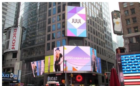
JUUL billboard in Times Square, New York City, 2015. https://www.spencer-pederson.com/work-1/2017/2/23/juul-go-to-market

When JUUL was first launched in 2015, the company used colorful, eye-catching designs and youth-oriented imagery and themes, such as young people dancing and using JUUL. JUUL's original marketing campaign included billboards, YouTube videos, advertising in Vice Magazine, launch parties and a sampling tour.