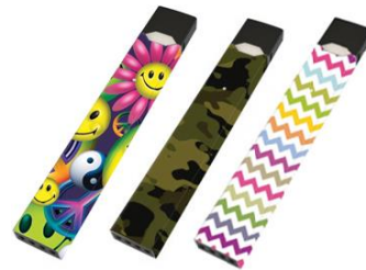
JUUL skins.

JUUL Labs produces the JUUL device and JUULpods, which are inserted into the JUUL device. In appearance, the JUUL device looks quite similar to a USB flash drive, and can in fact be charged in the USB port of a computer. According to JUUL Labs, all JUULpods contain flavorings and 0.7mL e-liquid with 5% nicotine by weight, which they claim to be the equivalent amount of nicotine as a pack of cigarettes, or 200 puffs. JUULpods come in five flavors: Cool Mint, Crème Brulee, Fruit Medley, Virginia Tobacco, Mango, as well as three additional limited edition flavors: Cool Cucumber, Classic Tobacco, and Classic Menthol. 1 Other companies manufacture “JUUL-compatible” pods in additional flavors; for example, the website Eonsmoke sells JUUL-compatible pods in Blueberry, Silky Strawberry, Mango, Cool Mint, Watermelon, Tobacco, and Caffé Latte flavors. 2 There are also companies that produce JUUL “wraps” or “skins,” decals that wrap around the JUUL device and allow JUUL users to customize their device with unique colors and patterns (and may be an appealing way for younger users to disguise their device).